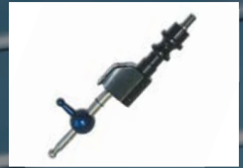
Sport Shifter (M/T only)