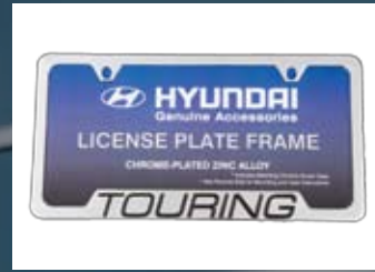
License Plate Frame