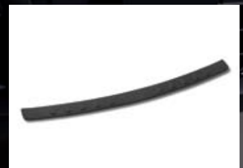
Bumper Protector, Rear

U8780-2L000-XX* w/o Sunroof U8781-2L000-XX* w/Sunroof