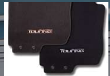
Floor Mats, Carpeted