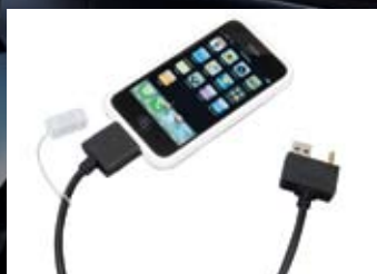
Adaptor Cable for iPod 3