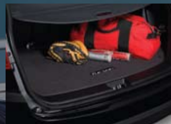
Cargo Screen 2