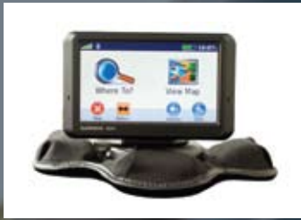
Garmin nūvi® with optional Friction Mount 1