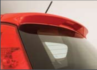
Spoiler Kit, Rear