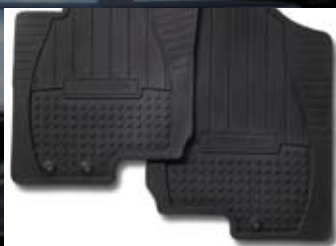
Floor Mats, All Weather

08140-2L210-9K Beige 08140-2L210-WK Black