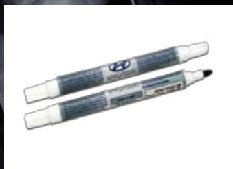
Paint Pen, Touch-up