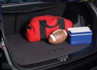
Cargo Mat, Carpeted