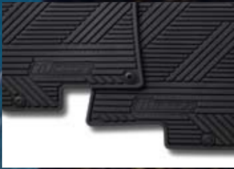
Floor Mats, All Weather