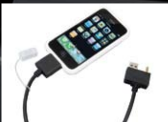
Adaptor Cable for iPod 2

00292-40000 nüvi ® 1390T GPS 00292-60000 nüvi ® 1690 GPS