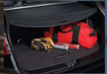
Cargo Cover, Screen