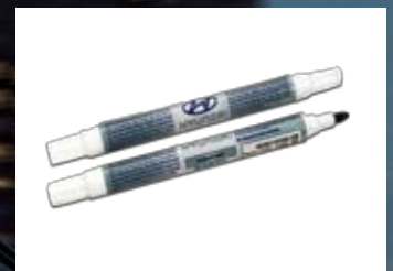
Paint Pen, Touch-up