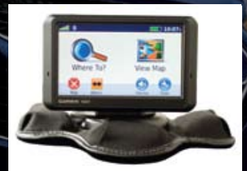
Garmin nüvi ® with optional Friction Mount 1