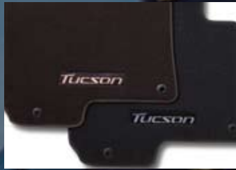
Floor Mats, Carpeted