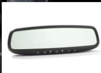
Mirror, Auto Dimming w/ HomeLink ® and Compass